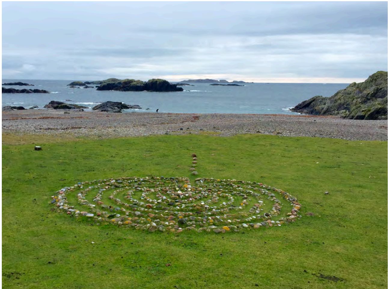
Stone labyrinth at St. Columba's Bay on the Isle of Iona, off the west coast of Scotland.